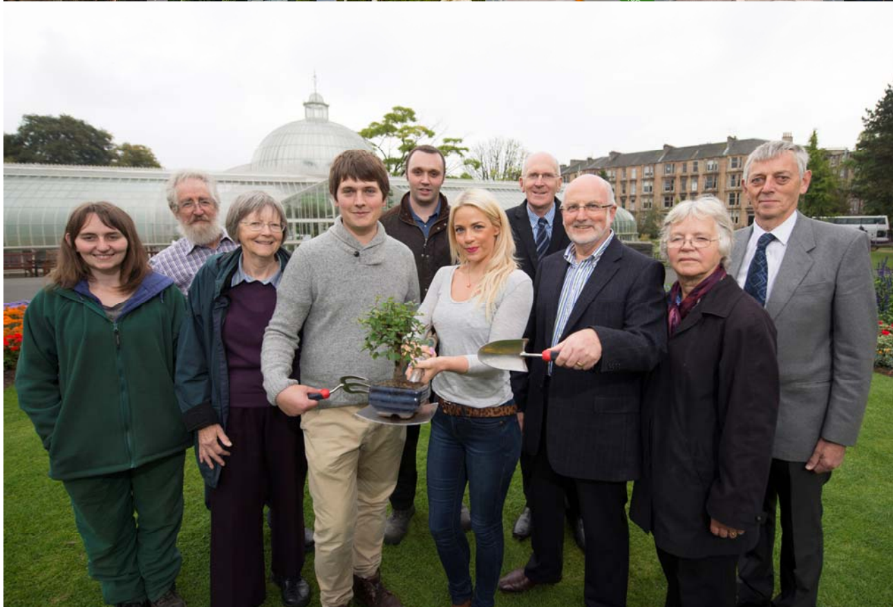
(Top) The Friends of Glasgow Botanic Gardens website which advertises the work of the Gardens and upcoming events (Bottom) Committee members and staff promoting the work of the Friends of Glasgow Botanic Gardens