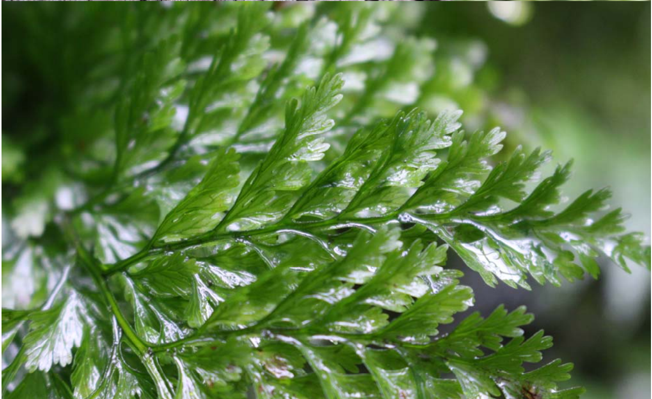
(Top) A botanical label featuring a QR code which enables access to further information online and a representation of the QR icon which you can use to access the web resources (Bottom) Image of Trichomanes speciosum which features in the Filmy Fern House