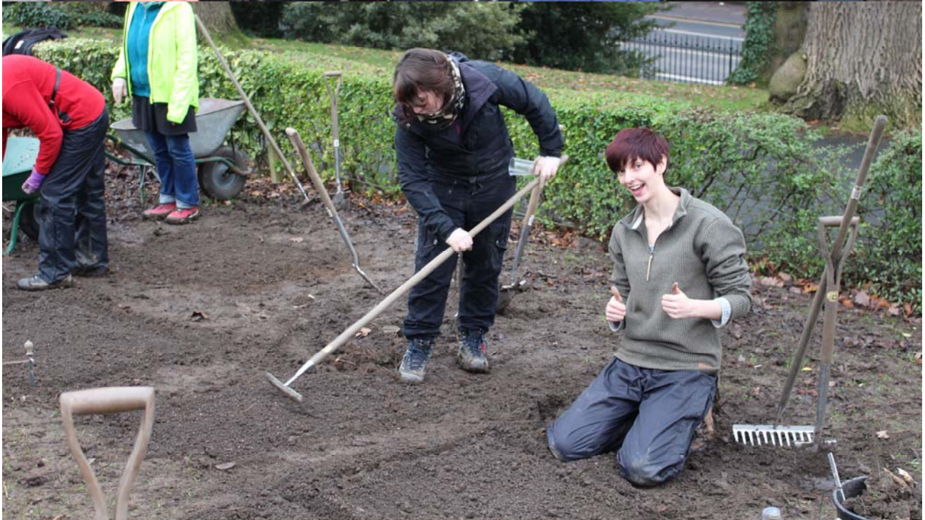
(Top) A social group enjoying refreshments in the Kibble Palace (Bottom) Students learning soil preparation techniques during a horticultural class