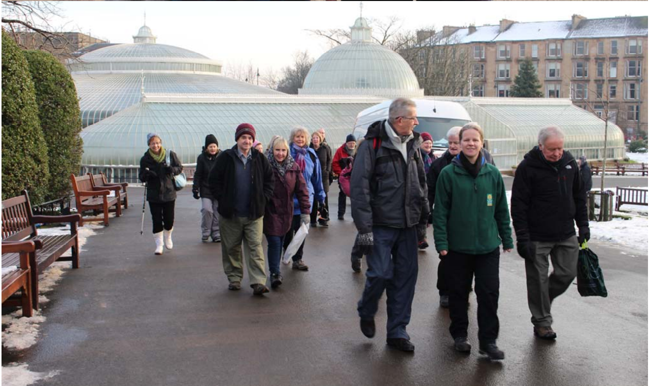
(Top) Park ranger guiding a member of the public (Bottom) Park ranger leading a weekly health walk starting and finishing at Glasgow Botanic Gardens