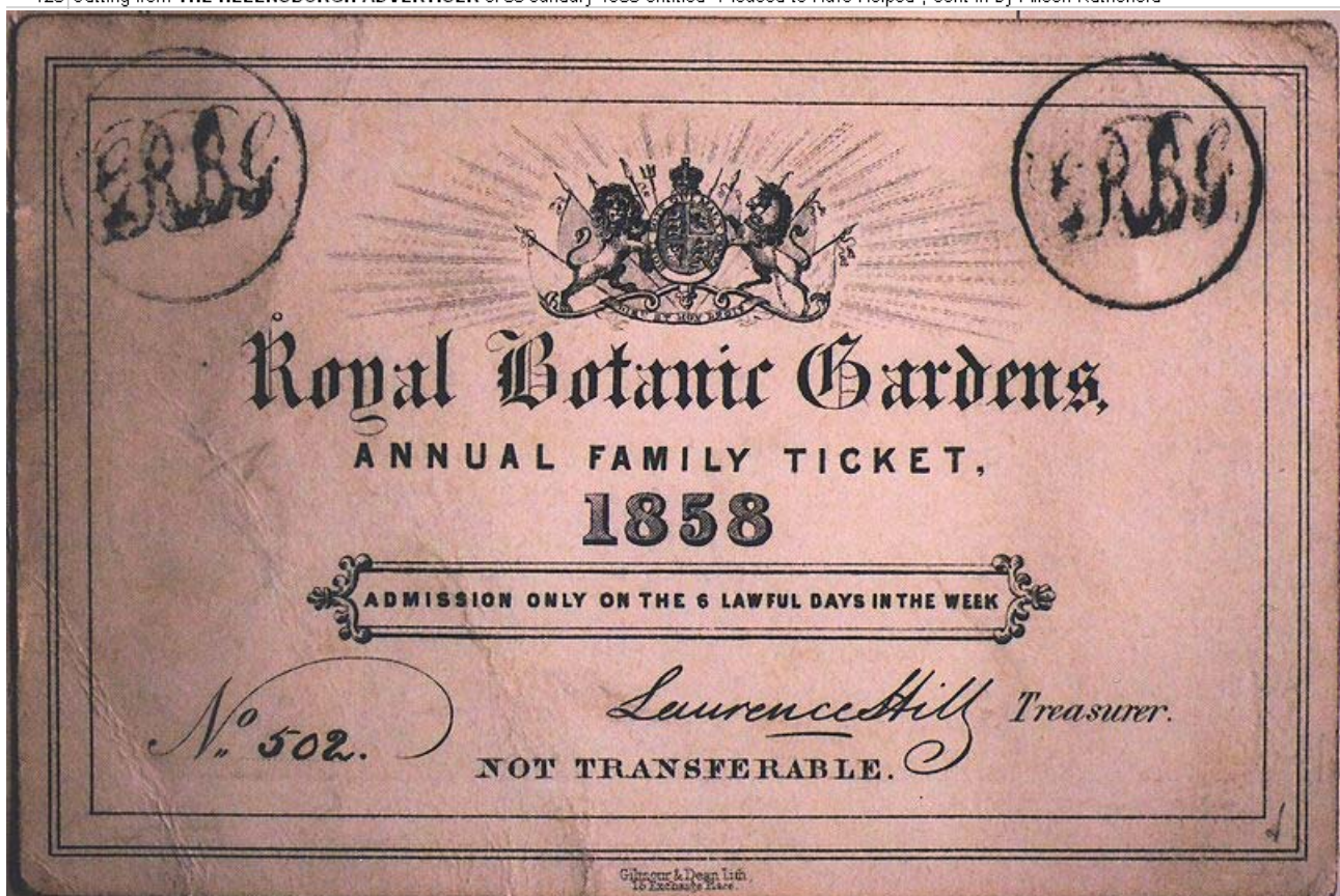
(Top) Example of the database documenting the archive collection at the Gardens (Bottom) An example of an annual family ticket from 1858 which is an item included in the archive collection