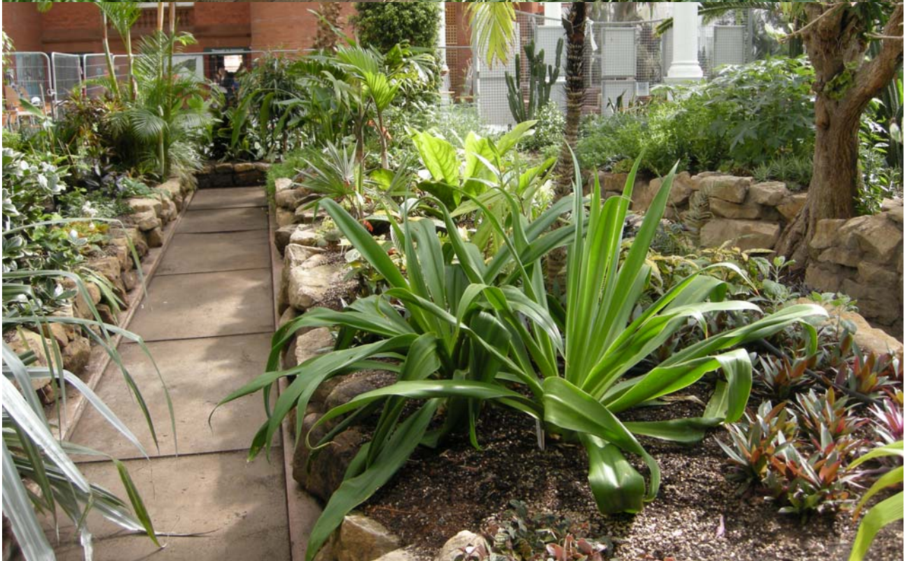
(Top) Begonia research group from the Royal Botanic Garden Edinburgh visiting the Begonia collection at Glasgow Botanic Gardens (Bottom) Development of the People's Palace and Winter Gardens aided by Glasgow Botanic Gardens staff and plant material