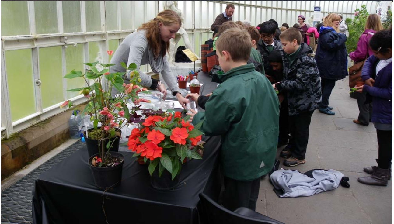
(Top) Undergraduate biology students from the University of Glasgow learning about ethnobotany (Bottom) Children participating in practical scientific demonstrations during Fascination of Plants Day.