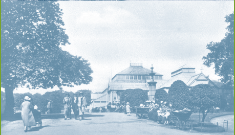
THE GARDENS THROUGH THE AGES